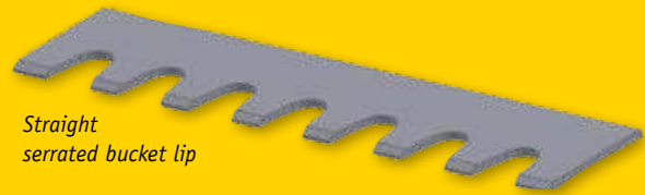
Straight serrated bucket lip